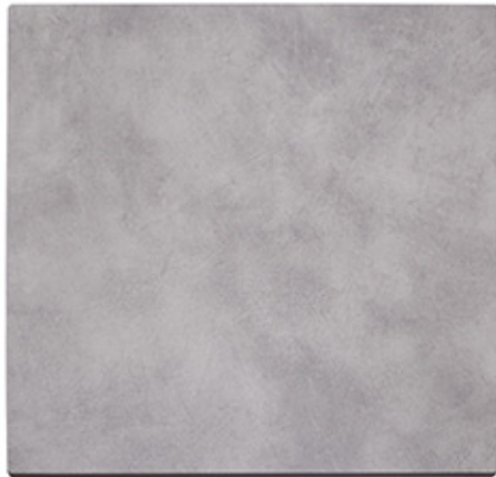
Table tops made from Compact Hpl of the Italian firm Abet Laminati.